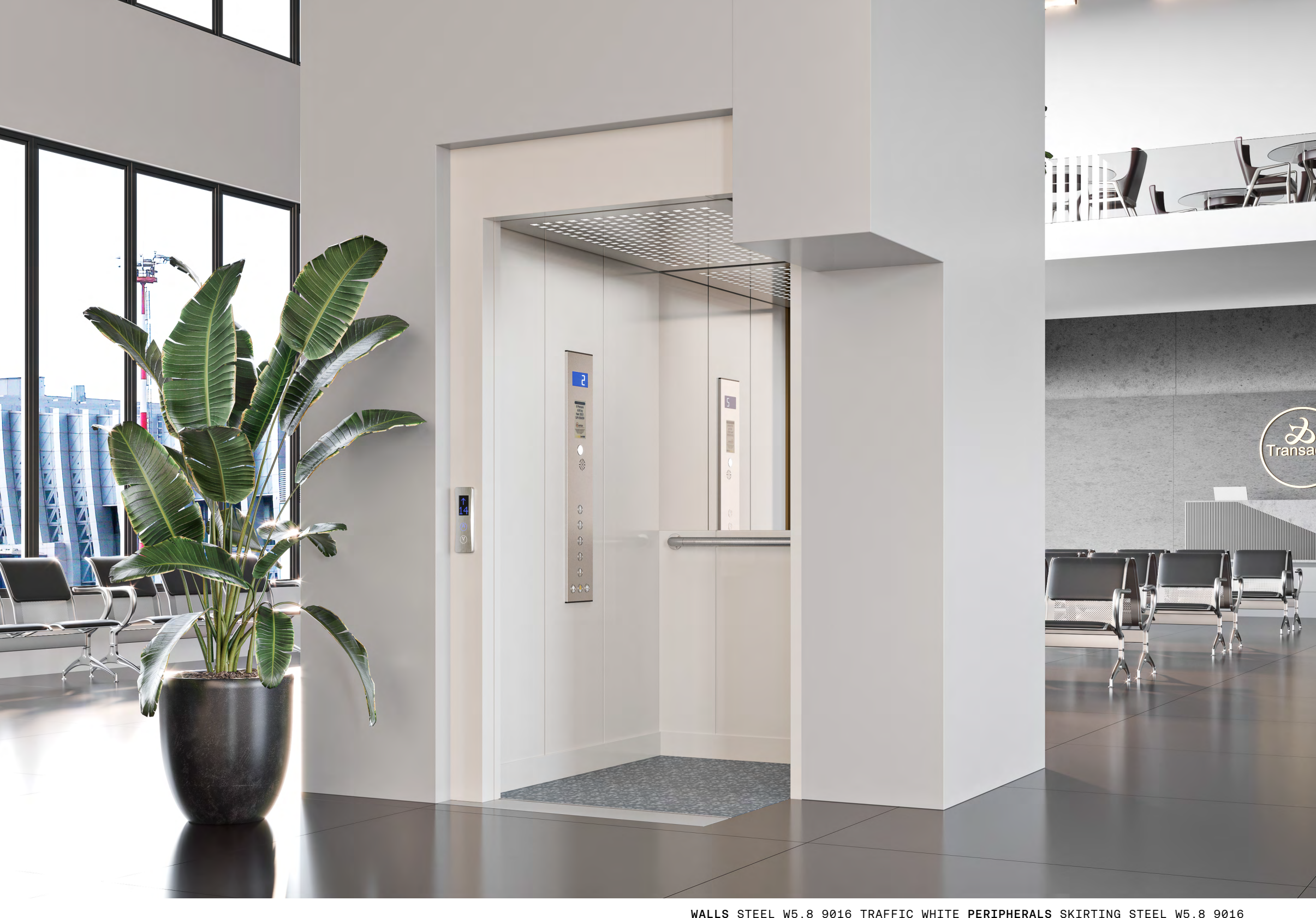
WALLS STEEL W5.8 9016 TRAFFIC WHITE PERIPHERALS SKIRTING STEEL W5.8 9016 TRAFFIC WHITE / FALSE CEILING A8.23 FC23 W4.2 SUPER MIRROR N8 / HANDRAIL A5.3 HR4 W4.1 SATIN/HL/SB/N4 / FLOOR F2.3 PF3 VENUS