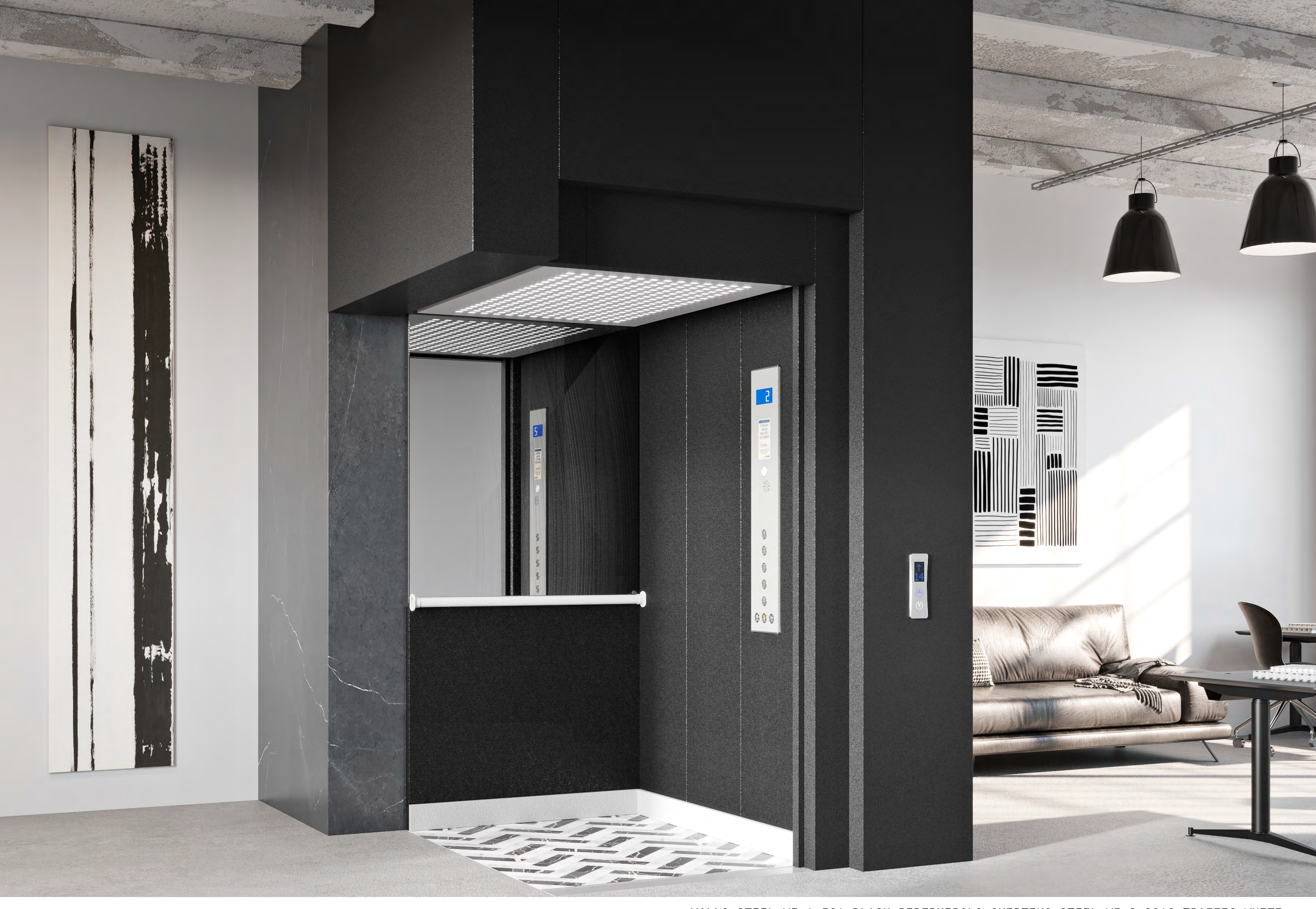
WALLS STEEL W5.1 501 BLACK PERIPHERALS SKIRTING STEEL W5.8 9016 TRAFFIC WHITE / FALSE CEILING A8.23 FC23 W5.8 9016 TRAFFIC WHITE / HANDRAIL A5.1 HR2 W5.8 9016 TRAFFIC WHITE / FLOOR PLASTIC/VINYL CUSTOM PRINTING